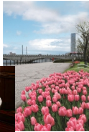
↑Bandai Bridge and tulips