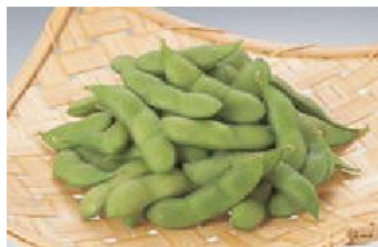
↑Kurosoke Chamame beans Koshihikari rice, grown in Niigata