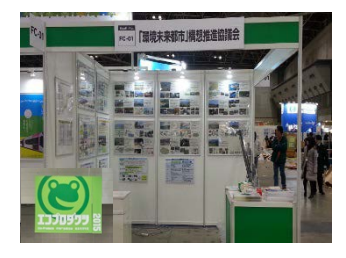
Council's booth to promote the "FutureCity" Initiative

This pamphlet is widely distributed through such events as the International Forum on the "FutureCity" Initiative and other exhibitions, etc. We prepare the pamphlet in both Japanese and English to distribute it to overseas participants in International Forums, etc. and disseminate the "FutureCity" Initiative both domestically and internationally.