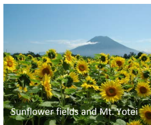
Sunflower fields and Mt. Yotei