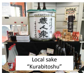
Local sake "Kurabitoshu"