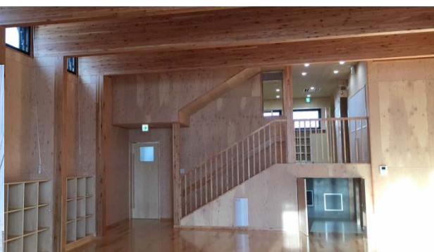
Niseko Kids Club after-school childcare facility (newly built in 2015)