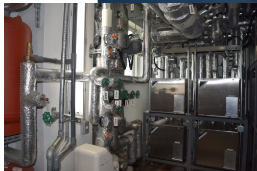
Niseko Community Center (extensive renovations in 2011)