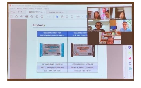
Hanoi Matching Permanent Exhibition (August-October 2020)