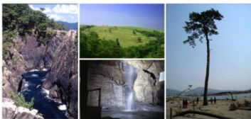
Left: Goishi Coast, Ofunato Center top: Taneyamagahara, Sumita Center bottom: Rokkando Cave, Sumita TRight: Miracle Pine Tree, Rikuzentakata