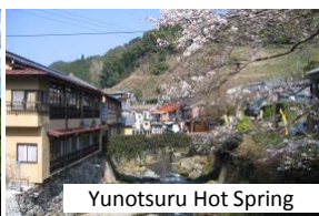
Yunotsuru Hot Spring